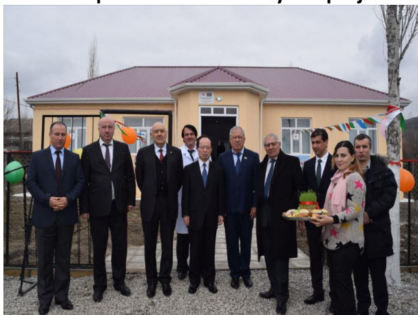
Medical point constructed by the project