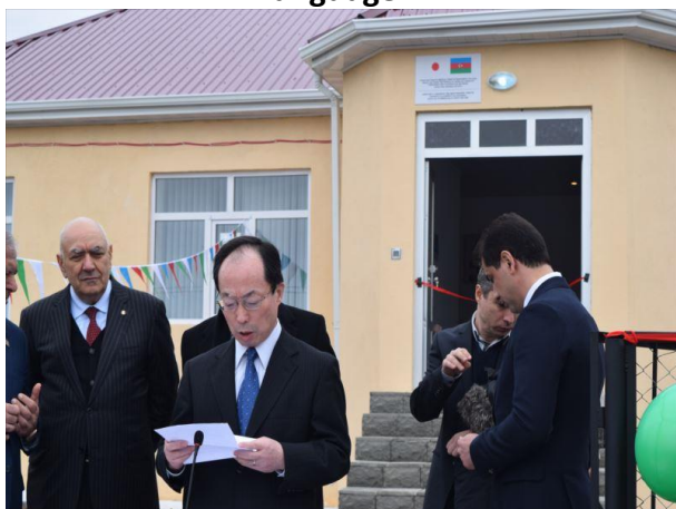
Speech by the Ambassador in Azeri language